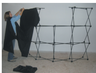
Begin at the stage opening and work your way to the top outside corner.