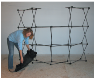
Remove contents of drawstring bag. Begin by applying the fabric cover.