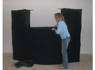
Attach the velcro to the fabric covering in the front of the stage and the velcro hubs in back.