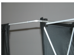
For average sized puppets, push the curtain rod extenders into the metal tube.