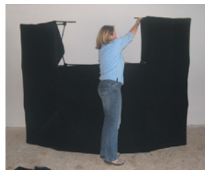
Attach the velcro of the side stage flaps to velcro hubs in the back.