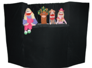
Now it's time to have FUN!