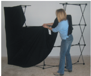
Work towards the center of the stage. Continue to line up the