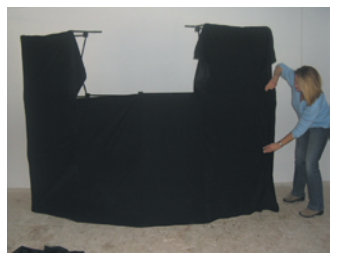
Secure the fabric covering at the corner hubs.