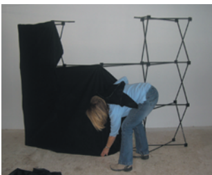
top squares of velcro, then the middle and then bottom.