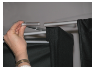
Repeat process on other side.