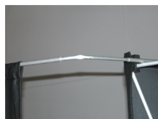
For larger puppets and stage opening, pull the curtain rod extenders out for more space.