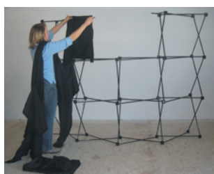
Apply the velcro of the cover to the corresponding velcro of the square hubs.