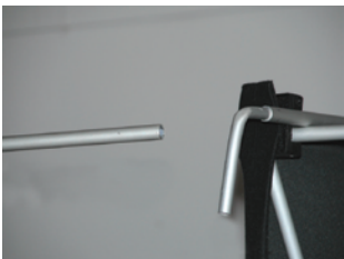
Insert the L-shaped curtain rod extenders into the open metal tubes of the stage.