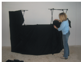
Work towards the other side of the stage, smoothing the fabric covering as you go.