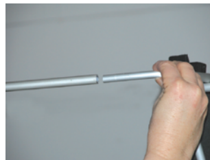
Insert the curtain rod into the other end of the L-shaped rod extender.