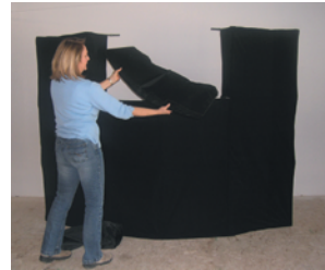
Unfold and place the playboard on the stage opening,