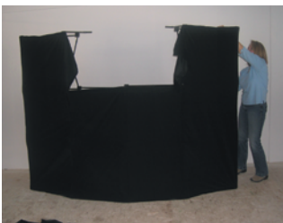
Pull the covering around the back edge, attaching to the velcro hubs in the back.